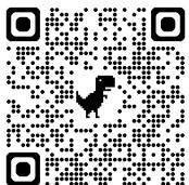
Virtual Information Meeting